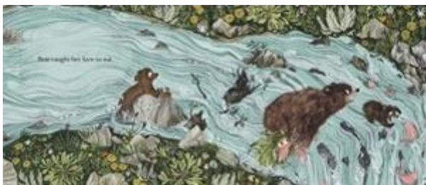
Illustration: Emily Hughes

A little girl grows up with animals in the wild, but is discovered and taken to "civilization". She hates it, as it is simply not natural to her. Serious questions are posed in wonderful, wild and happy illustrations with a retro feel