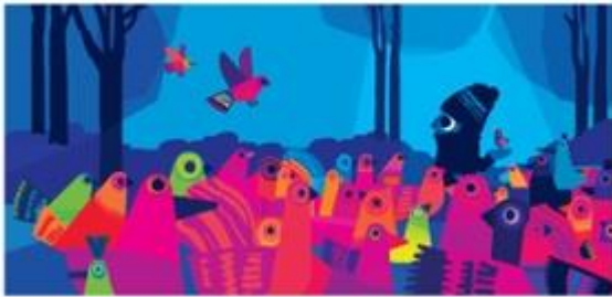
Illustration: Chris Haughton

Chris Haughton delights children as well as adult collectors of books that excel in illustration and design. The glowing, deep colours and highly stylized yet convincing characters create a visual language that claims a real presence on the contemporary picture book scene