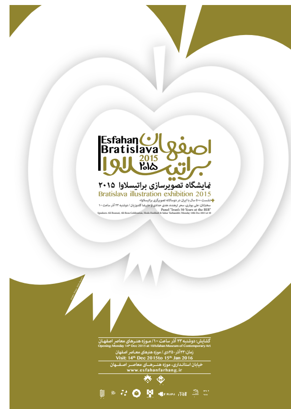
Isfahan-Bratislava exhibition poster. Deigned by: Golriz Gorgāni